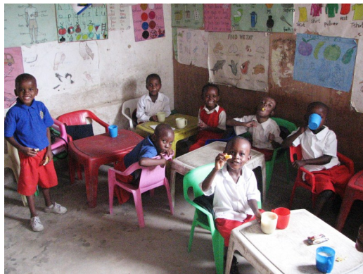
Kindergarteners enjoying a snack.