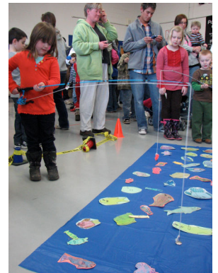
Right: One of the many games at the African Festival.