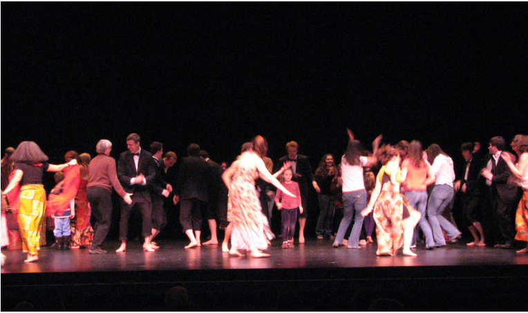
Audience members join members of the Somabeats, Wulaba, and Top Cats in a community dance.

The North Country came out in support for Jambo Jipya School at the first ever Reason2Smile Arts Night held at the Lake Placid Center for the Arts in early March. Attendees enjoyed perusing the artwork made by professional and student artists, as well as the Kenyan marketplace which filled the lower lobby of the LPCA. The Saranac Lake High School Men and Women's Ensembles started off the evening and were soon followed by the UVM Top Cats (an all male a cappella group from the University of Vermont). The place was rocking as the Top Cats shared their talent and energy. To end the night with an African feel, Wulaba Drummers and Somabeats Dancers took the stage and got the blood pumping! There