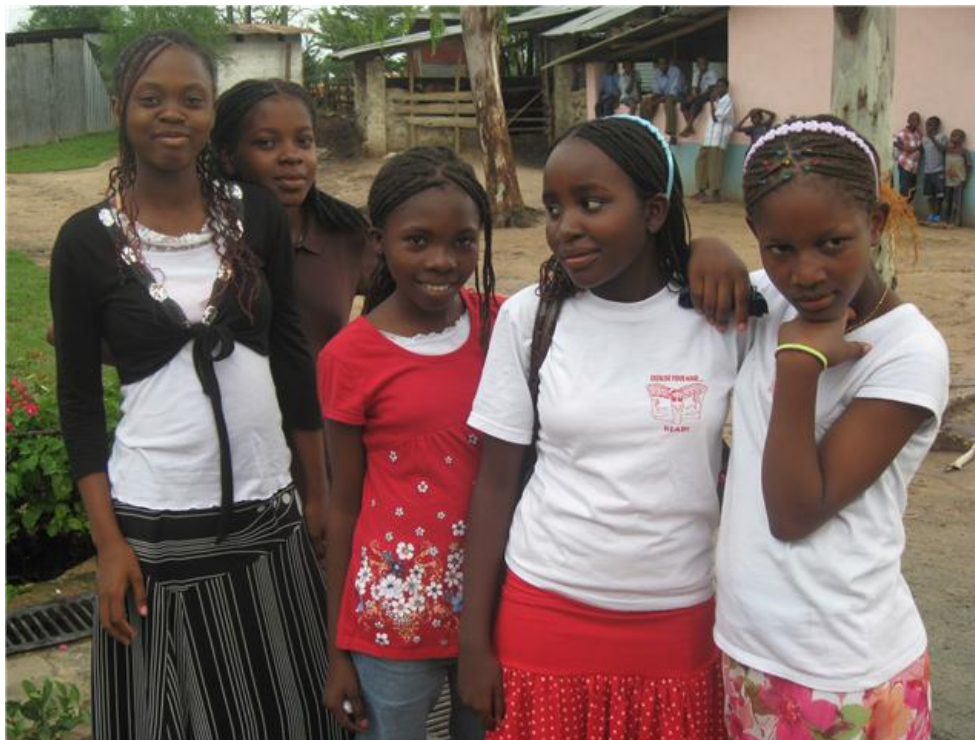
Five of the beautiful teenage girls who live at Jambo Jipya all dressed up in their new clothes with their hair nicely braided as a Christmas treat!